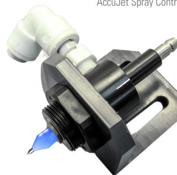
AccuJet Single-Point Continuous Nozzle