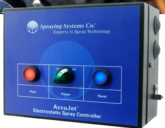
AccuJet Spray Controller