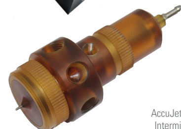
AccuJet Single-Point Intermittent Nozzle